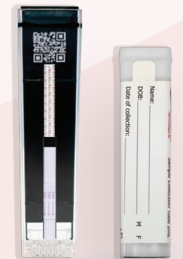
Accu-Reader® A100 Test Cartridge & Sample Collection Tube